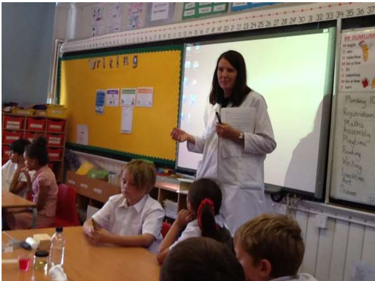
We had a special visitor in school to support us with our work on states of matter.