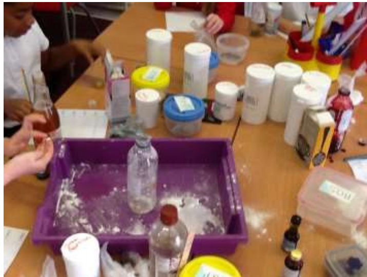
The children made potions and experimented with solids, liquids and gases. They used the process to write a set of instructions.