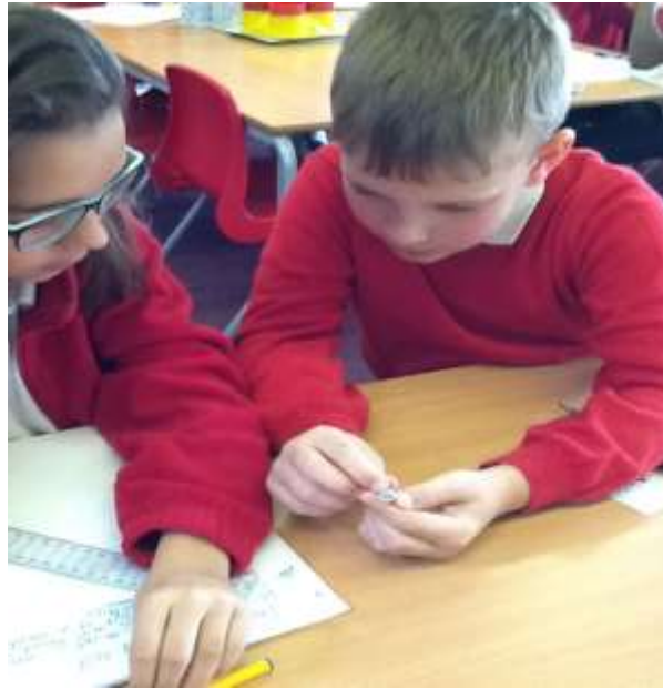
They looked closely to identify the filament in a bulb.